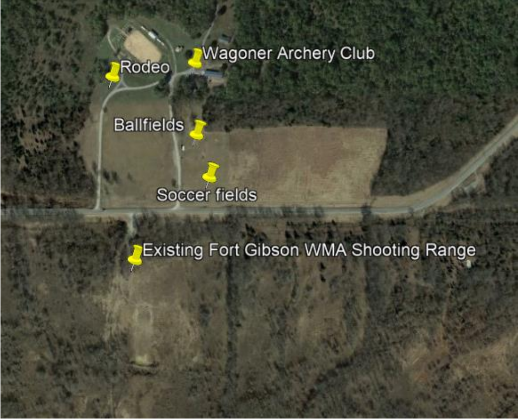
Preliminary Layout at Proposed New Range Location: