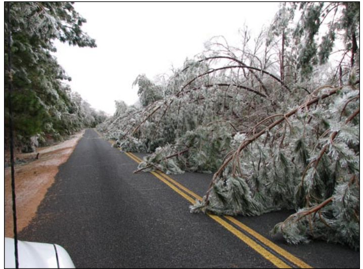
Trees weighted down with ice obstruct road at the Fort Gibson Lake project. It is estimated that nearly $500,000 in damage occurred at Tulsa District parks.

the Corps the emergency power mission, Southwestern Division's Power Response Team from Tulsa District mobilized. Although some members were themselves victims of the storm and people and equipment from the 249th Engineering Battalion "Prime Power" and the Corps emergency power contractor, IAP Worldwide Services, had to come from several states and travel through icy areas to respond, the team was soon