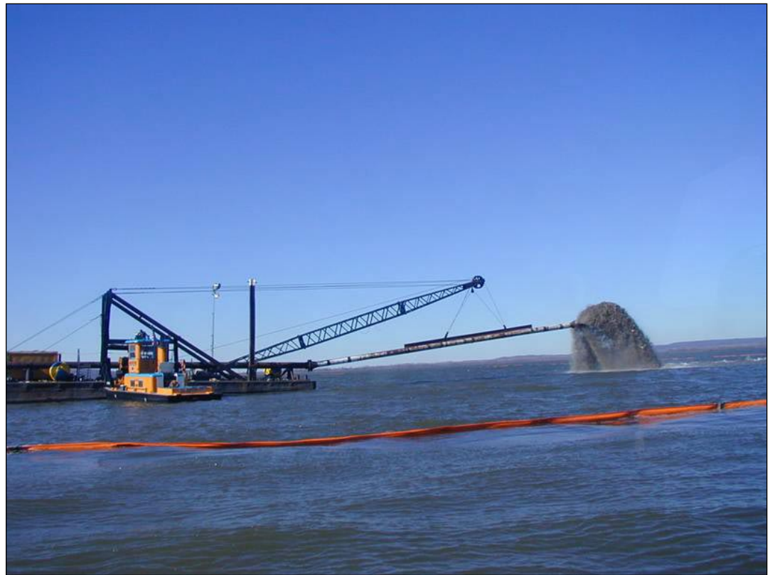
Dredging the McClellan-Kerr Arkansas River Navigation System channel, Oklahoma. Photo shows the dredge placing material inside the silt curtain to reduce turbidity in the river.

The city will provide the construction plans and specifications and the Corps will conduct all con-