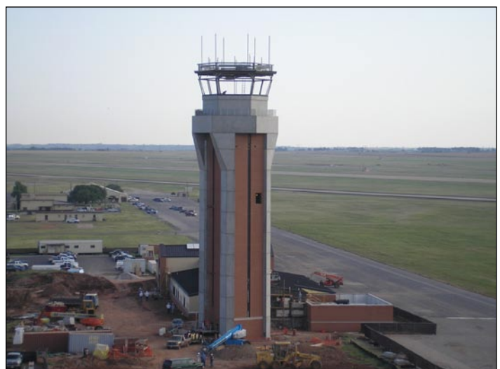
Air Traffic Control Tower at Sheppard Air Force Base