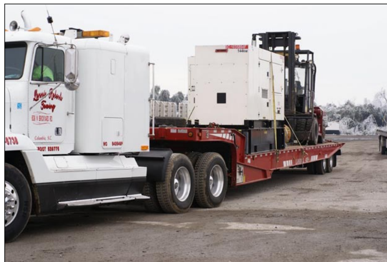
Truck with two generators, fork lift and wire prepares to leave the Federal Staging Area outside McAlester Army Ammunition Plant, McAlester, Oklahoma.

Emergency operations and our capability to react in an emergency is important for this nation. It ties very nicely with the Corps identified mission to support national economic development and security.