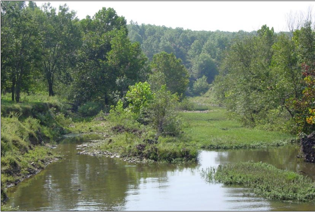
The Candy Lake area of Oklahoma.

descendants and complete the Environmental Assessment.