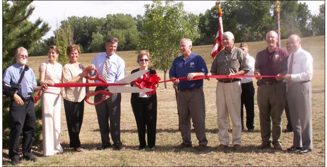
Ribbon Cutting (above)

The project consisted of five miles of levee along the Arkansas River, one and a half miles along the Walnut River, and the rechannelization of two miles of the Walnut River, as well as all associated drainage struc-