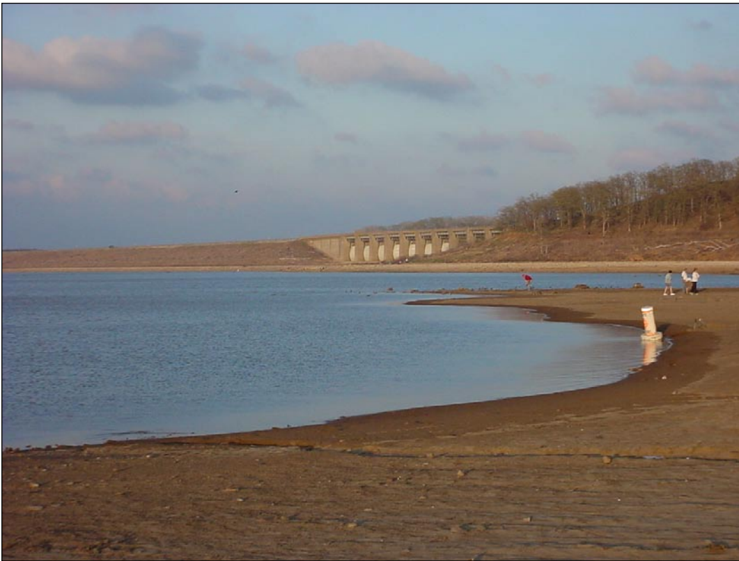
Hulah Lake during the drought of 2002. With information from the study, Bartlesville, Oklahoma, can make informed decisions to reduce impacts from similar drought situations.

next 50 years. Once that data is clearly established, the study team will analyze alternatives such as: the cost of storage and conveyance from Kaw Lake and the impacts for reallocating from the flood pool on Hulah and/or Copan Lakes. Cost estimates will be an integral part of this study.