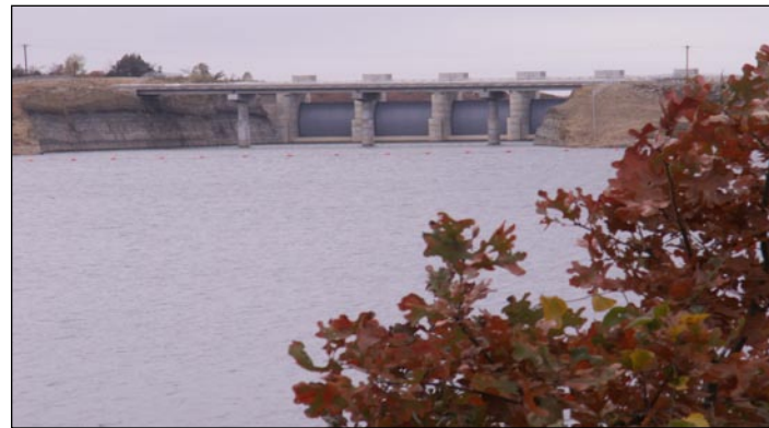
Tenkiller Dam is located on the Illinois River 7 miles northeast of Gore, Oklahoma, and 22 miles southeast of Muskogee, Oklahoma. Construction of the Tenkiller Lake was completed in May 1952.