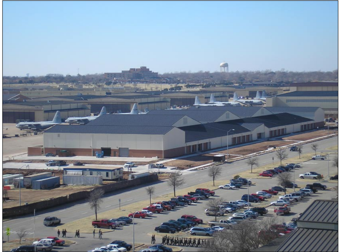
Sheppard AFB, F-22 Technical Training Facility