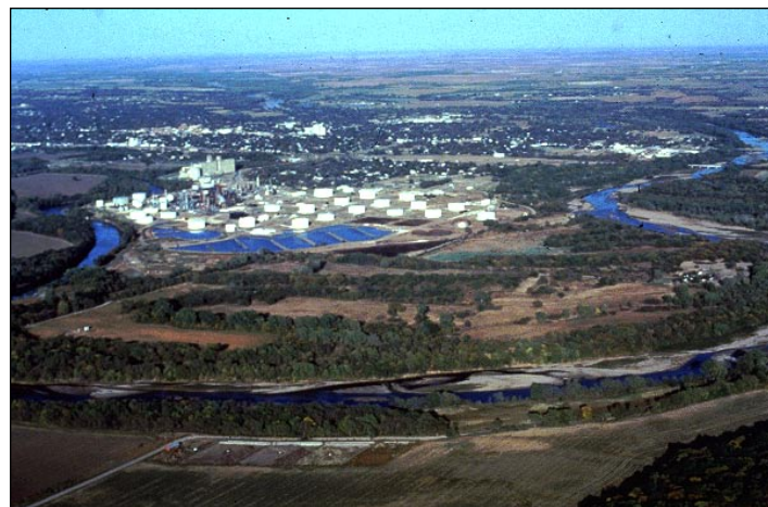
Arkansas City lies at a bend along the Walnut River

Mel Thompson, of U.S. Senator Pat Roberts' office