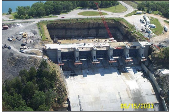
A mountain of rock was removed to make way for the construction of the spillway.

There were many challenges, including a slide when the new highway fill was placed on an ancient fault not detected during investigations for the project. Mead expanded on another. "Concrete generates heat when it cures, and placing large volumes in small areas can result in temperatures so high that the concrete can be damaged." The new spillway was constructed using about 40,000 cubic yards of concrete which is enough to cover a football field 7.5-foot deep. He explained that special cement (low heat of hydration) and a high percentage of fly ash were used