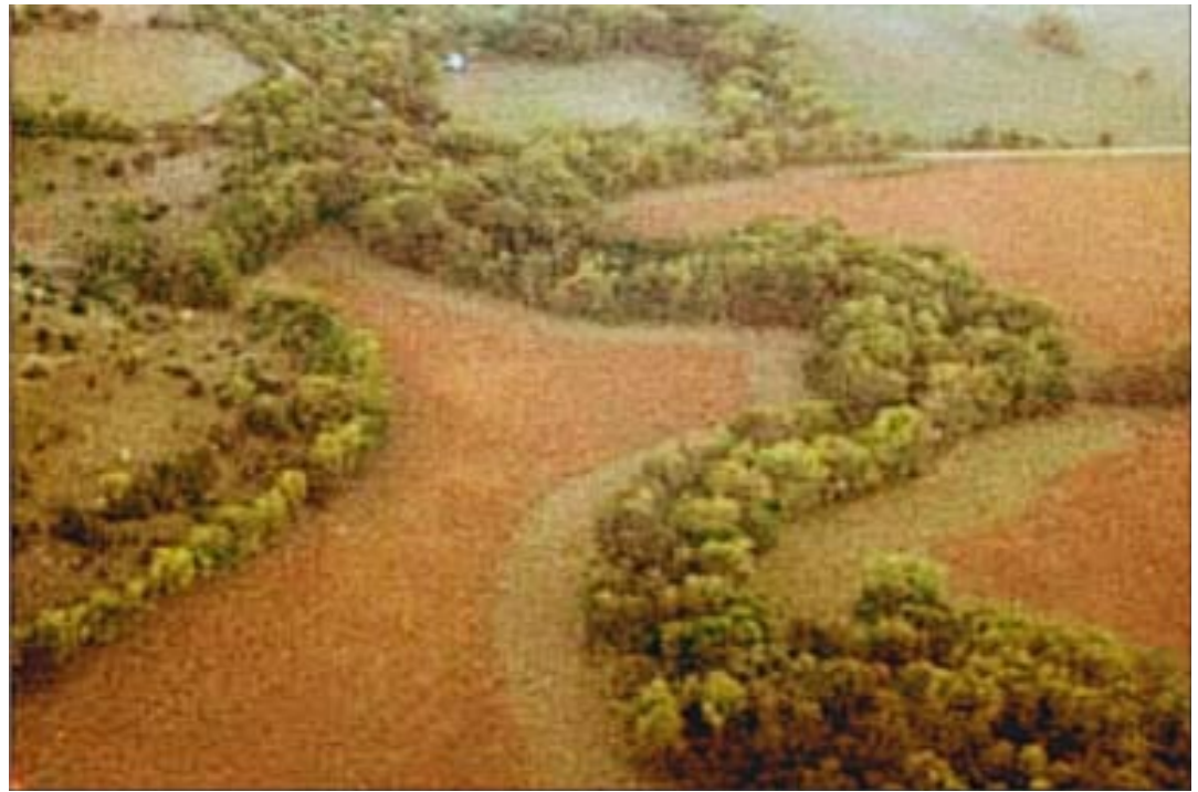
An example of a simple riparian buffer strip being evaluated in the Walnut River Basin Feasibility Study. The buffer is composed of trees nearest to the river and an outer grass buffer to reduce runoff velocities, retain eroded soils, and add value and diversity to the riparian ecosystem.

The project is essentially complete and consists of the reestablishment of an aquatic wetland ecosystem corridor along the North Canadian (Oklahoma) River between Western Avenue and May Avenue in Oklahoma City. The restoration was accomplished by constructing about 26.5 acres of wetlands and related water control structures to manage the wetlands. The low-water dam near Western Avenue was constructed by Oklahoma City and creates a backwater pool with about 145 acres of open water aquatic habitat and provides a reliable