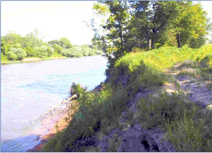
This is an example of a typical eroded bank along the Neosho River. Sedimentation occurs throughout the watershed and stream and river bank erosion is an issue to be addressed in the feasibility study.

levees), nonstructural measures (such as flood proofing and buyouts of flood prone structures), changes in the system operation, and combinations of measures.