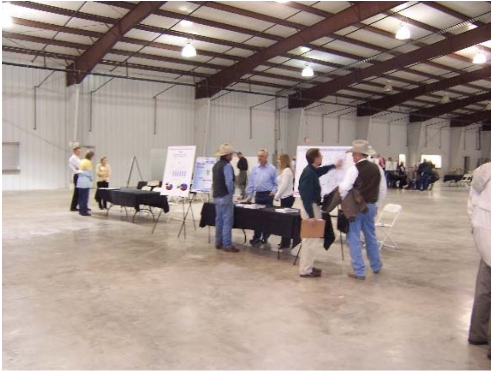
December 8, 2009 public scoping meeting in Bonham, TX