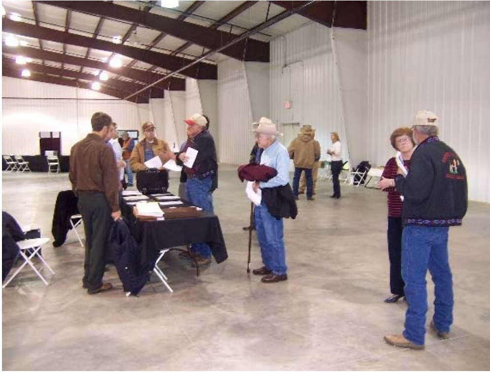
December 8, 2009 public scoping meeting in Bonham, TX