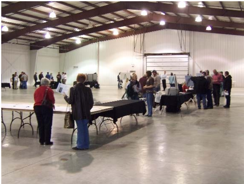
December 8, 2009 public scoping meeting in Bonham, TX