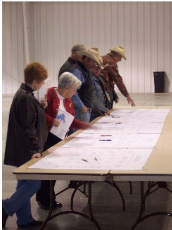
December 8, 2009 public scoping meeting in Bonham