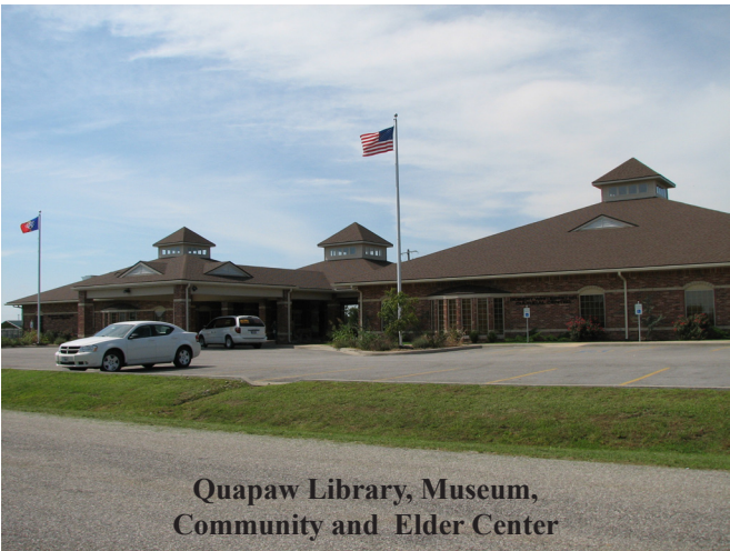
Quapaw Library, Museum, Community and Elder Center