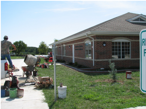
Landscaping at Seneca-Cayuga career resource center

While respecting the history and sovereignty of Native American Nations, Tulsa District can assist Tribes in providing for members' immediate and future needs.