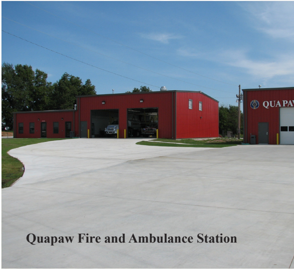
Quapaw Fire and Ambulance Station

US Army Corps of Engineers® Tulsa District