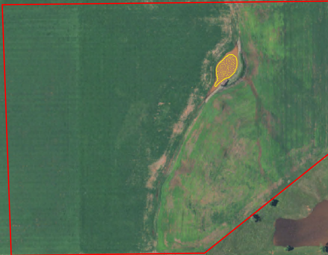
Figure 1: AJD Delineation Site Map